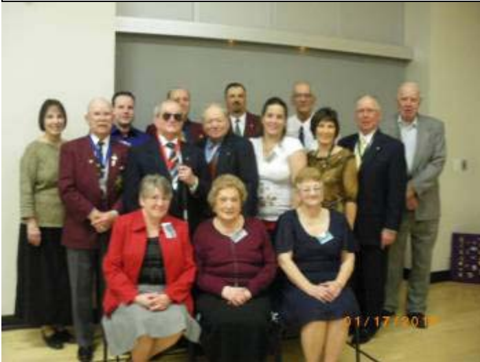
Strathroy-Caradoc Charter Members