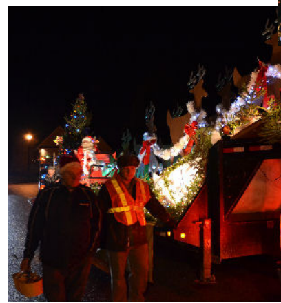
It's just amazing to see the excited children's faces as the float approaches. SANTA IS REAL!!!!