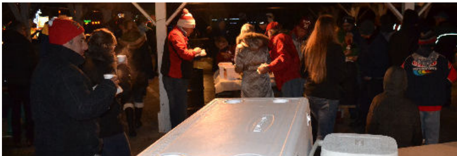
Above: The throng of happy neighbours in a great community get-together!

Right: The log cabin and the surrounding area had been decked with Christmas lights. The inside of the cabin prepared fit for Santa!! Great effort on behalf of Heather Greig!!