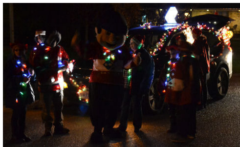
Just a sample of the astonishing array of wonderful floats that took part