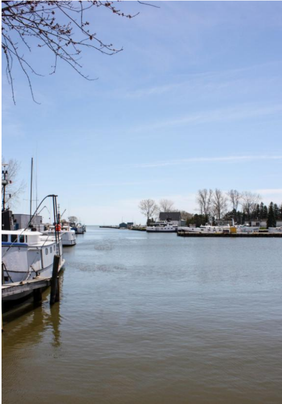
Title Page Photo Wheatley Harbour Wheatley, ON

JELLY BEAN POEM Little jelly beans Tell a story true. A tale of Father's love Just for me and you. GREEN is for the waving palms. YELLOW is for the sun above. BROWN is for the soft earth where People sat hearing of HIS love. A SPECKLED bean for fish and sand. RED for precious wine and BLACK is for the sin He washed From you soul and mine. PURPLE's for the sadness of HIS family and friends, and WHITE is for the glory of the Day HE rose again. Now that you've heard the story You know what each color means. The story of our Father's love Told by some jelly beans. So every morning take a bean They're really very yummy. Something for the soul, you see And something for the tummy. Author Unknown