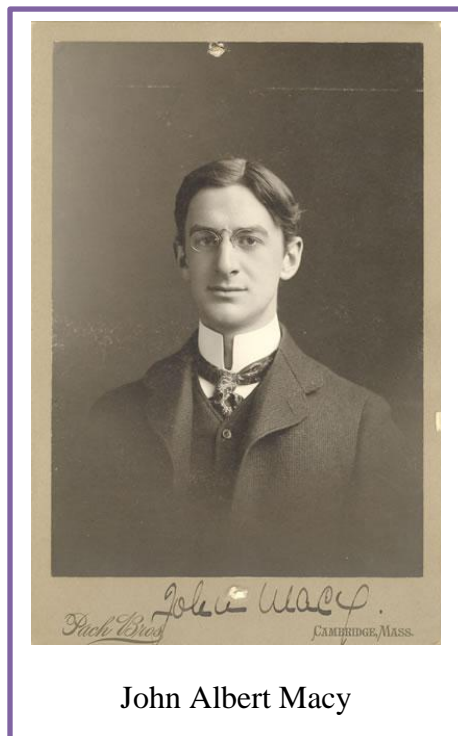
John Albert Macy

In February 1913, Anne and Helen began a fifteen-month lecture tour in the Northeast in an effort to supplement their income from Helen's writing. At this time, John and Anne's marriage began to collapse and in May, John traveled alone to Europe. Although the reasons are unclear, Anne's fiery nature and the household's shaky financial situation may have been part of the problem. However, ultimately, John may have felt neglected by Anne in favour of Helen, and in 1914 he left the household for good. In the fall of that year, a young Scotswoman, Polly Thomson, joined the two women as a secretary for Helen.