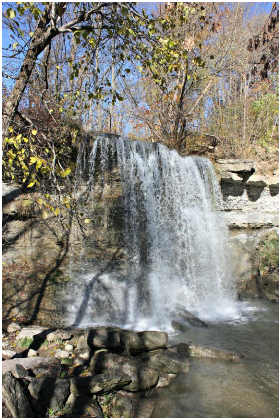
Title Page Photo Rock Glen Conservation Area Arkona, ON