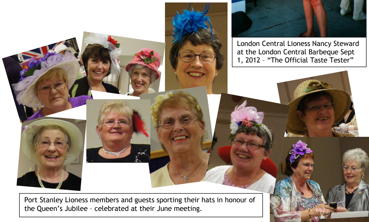
Port Stanley Lioness members and guests sporting their hats in honour of the Queen's Jubilee - celebrated at their June meeting.