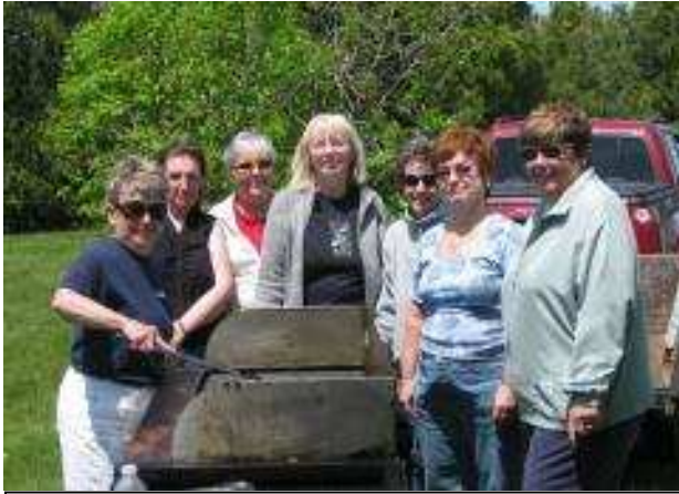
Wheatley Lioness Club members after providing a BBQ at the Wheatley Public school track and field meet.