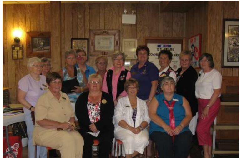
2012 – 2013 Executive after installation