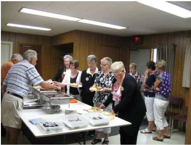
Lioness being served breakfast by the Harrietsville Oddfellow members.