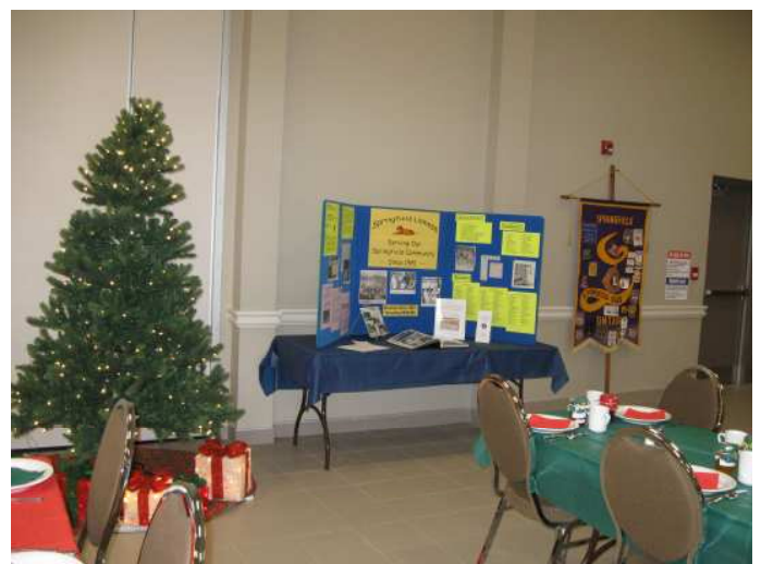
Springfield Lioness Display and banner at their annual "Christmas In July" event for the seniors in Springfield