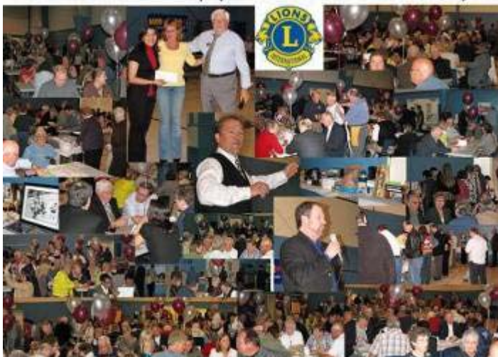
London Central Lions - Ivey Eye Institute Dinner and Auction May '09