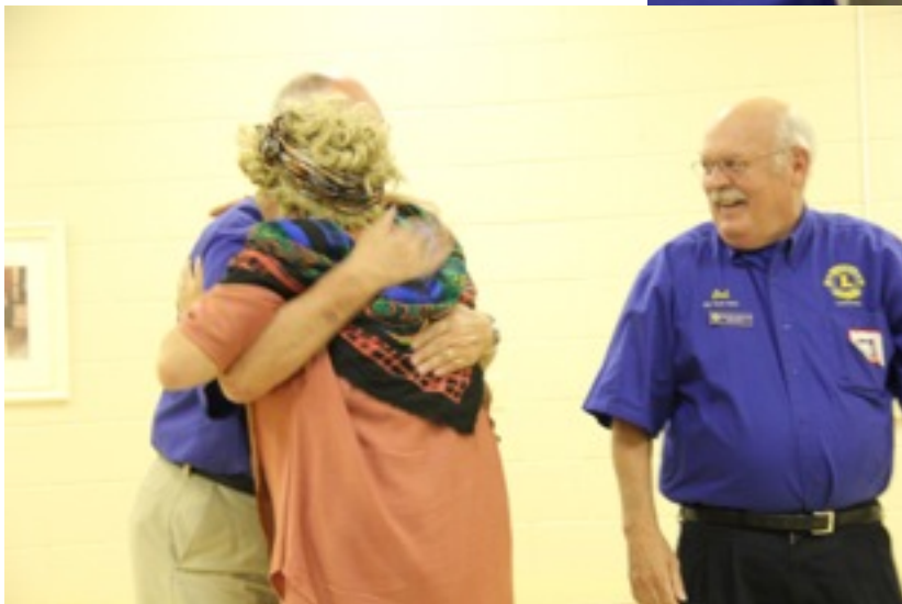
All is forgiven...