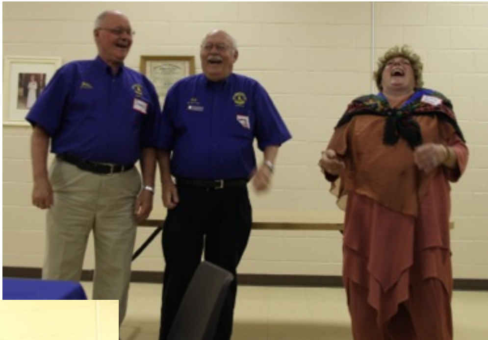
Lotta compared them to the two muppets who sat on the balcony...