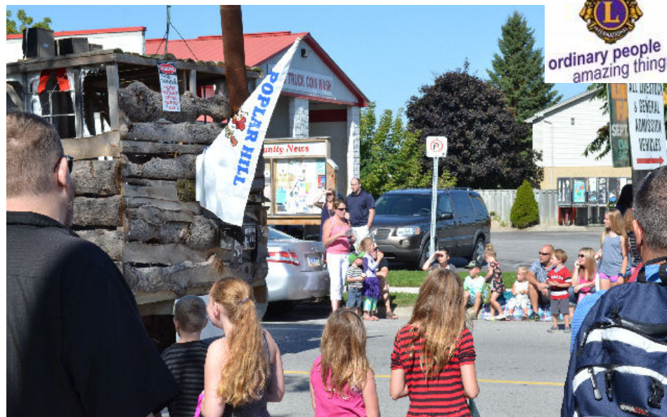
Above: No, it wasn't the Santa float but the kids look on transfixed at the strange phenomena passing by!