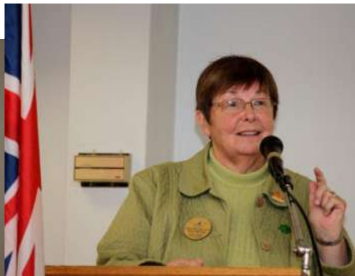
Some words of wisdom at Belmont