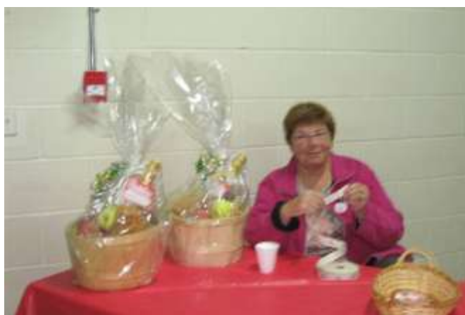
At Wheatley's Kids Christmas Event