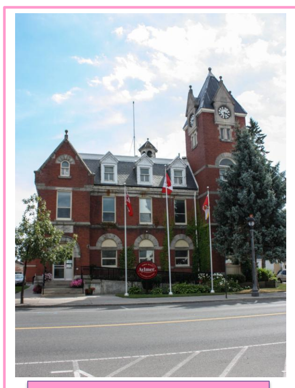
Title Page Photo Town Hall Aylmer, ON