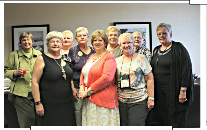
Past District Presidents