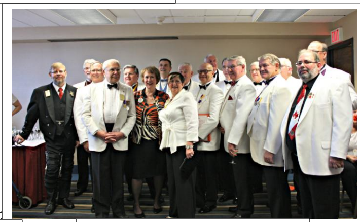
Past District Governors