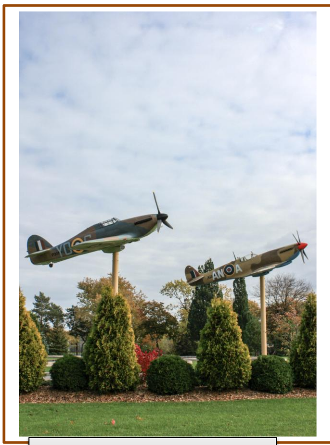
Title Page Photo Jackson Park Windsor Ontario