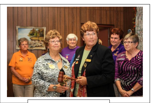
Handing the gavel over