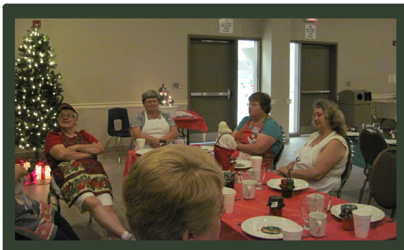
Springfield Lioness members and friends "working"?? at their annual Christmas in July for the seniors in Springfield.

When happiness gets into your system, it's bound to break out on your face.